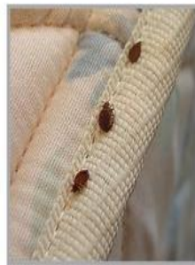
Adult bugs about the shape and size of an apple seed