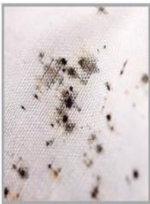
Black or brown stains, usually in crevices